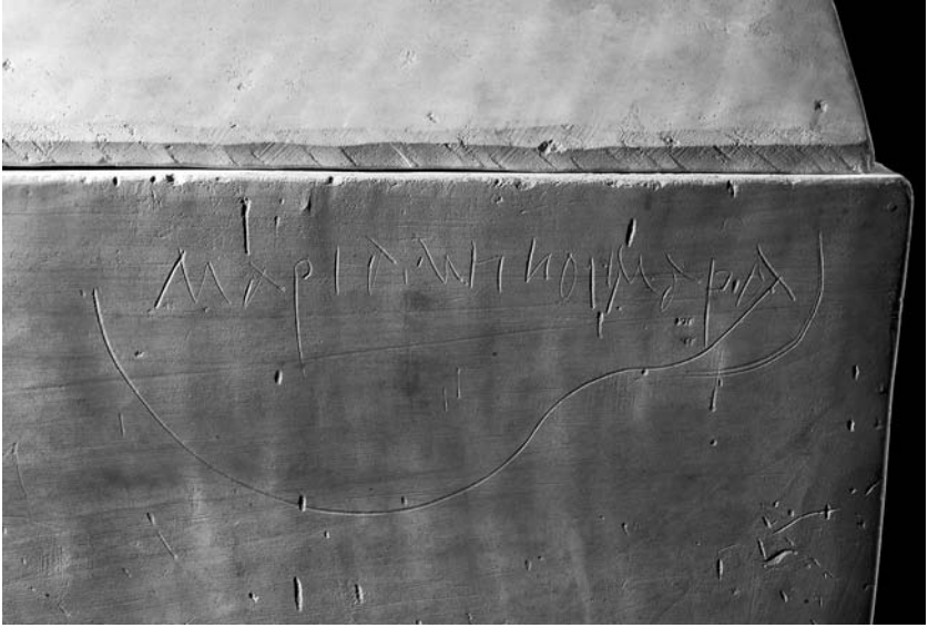
Figure 4. The “Mariamene” inscription