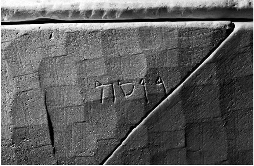
Figure 3. The “Yose” inscription