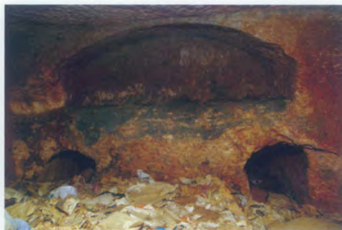
The inside of the Talpiot tomb, looking north.

My view is quite the opposite. I am convinced that there is a surprisingly close fit between what we might postulate as a hypothetical pre-70 CE Jesus family tomb based on our textual records, and this particular tomb with its contents. Rather