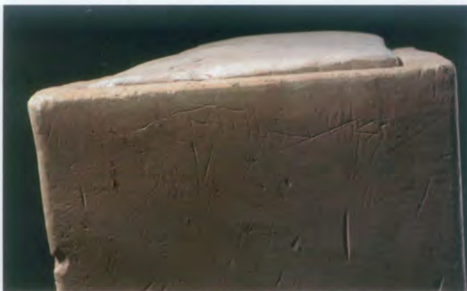
A close-up of the inscription "Jesus son of Joseph."

There are two "Marys" in this tomb, known by different forms of that name, namely Maria and Mariamene. The mitochondrial DNA test indicates the Mariamene in this tomb is not related to Yeshua as mother or sister on the maternal side. That leaves open the likelihood that Maria could well be the mother, especially if we have two of her sons, Yeshua and Yose, in this tomb. It would make sense that she would be buried with her children in this intimate, small, family tomb and that her ossuary would be inscribed Maria.